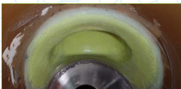
SAERTEX® multiHat combi result of the installation

Due to the innovative design of the SAERTEX® multiHat combi (GRP-Hat-Profile), a tight and wrinkle-free adaptation to the pipe and the diversion can be achieved in a safe and quick installation.