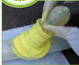
Fixing and Positioning of the UV packer

The installation of the GRP-Double-Hat-Profile SAERTEX® multiHat combi is safe and quick. For that reason, an UV silicone packer is fixed “wet in wet” with an UP-resin pre-impregnated GRP-Hat-Profile and an EP-resin on-site impregnated GRP-Hat-Profile and cured in only eight minutes. Thus, economically, the system is second to none.